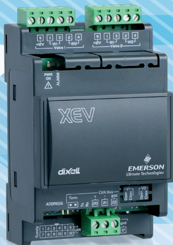
D: 4 DIN Rail